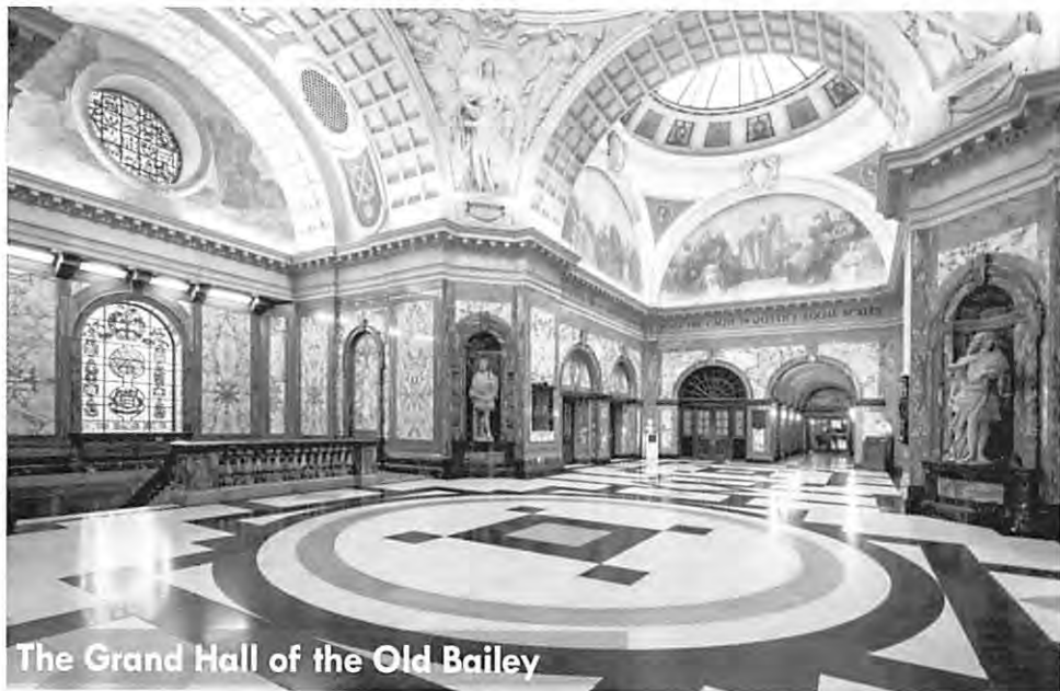
The Grand Hall of the Old Bailey