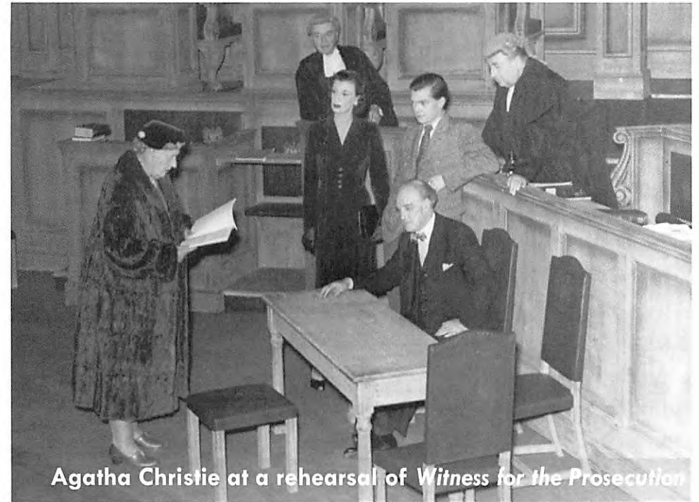
Agatha Christie at a rehearsal of Witness for the Prosecution

Initially Christie was told that her new ending wouldn't work and would have to be changed, but she fought desperately to keep it, going to the extreme of not allowing the play to go ahead without it. Fortunately, Christie got her way. She described the ending as "what could have happened, what might have happened, and in my view probably what would have happened", despite others resistance to it.